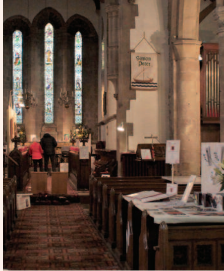
Travelling Treasure at St Peter's

In October & November, St Peter's Bywell and St George's Mickley hosted an exhibition called 'Travelling Treasure' which explored our village churches in an interactive way, not just as places of worship, but as places where people gather for significant moments, and places of history that hold community memories. The exhibition also celebrated churches as places where a lot of creativity is on show - from architecture to skilled needlework, to woodwork and flowers. Other parts of the exhibition looked at churches as places of light and colour, places with a strong tradition of music of all types, and perhaps surprisingly as places of change - yet the history of the church is one of change and growth and our buildings are constantly evolving to meet the needs of successive generations. And finally, of course, churches are places of faith - places which encourage us to engage with the big questions of life. All of this in all a really interesting exhibition that invited us to think about our churches in a different way.