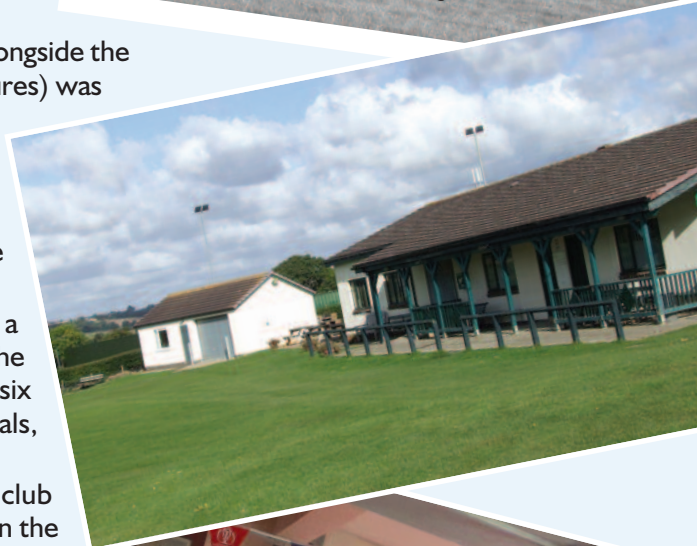
The Club House circa 1950s

Once League cricket resumed, the club had to wait until 1960 for their first ever championship, winning the West Tyne League. Success was rare during the 60s and 70s but the formation of a junior team, winning their first League trophy in 1970, was the beginning of an ever strengthening player base which has resulted in an amazing run of honours at all levels since then and up to the present day.