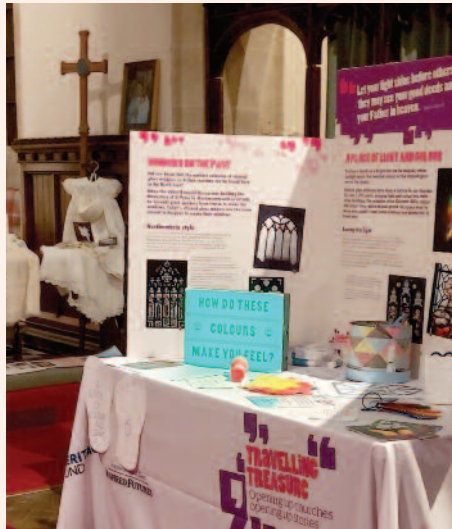
Travelling Treasure at St George's