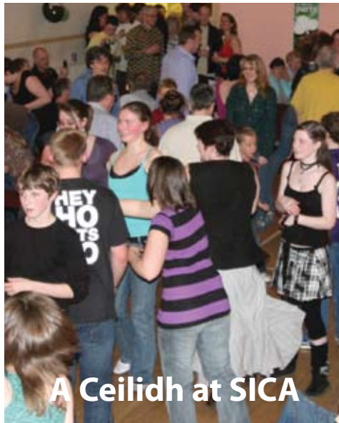
A Ceilidh at SICA

So please flip your calendar to September now and highlight the 12th! We look forward to sharing the celebrations with you. For additional festival news and updates please visit stocksfield.org .