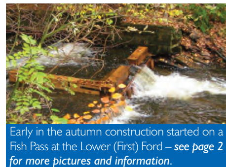
Early in the autumn construction started on a Fish Pass at the Lower (First) Ford – see page 2 for more pictures and information.

Included with this issue is a Christmas Card detailing services in all the churches in the Parish over the Christmas period.