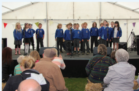
Broomley School entertains festival goers in the big Marquee