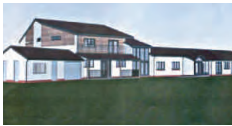
Artist Image of New Clubhouse

In the final analysis the Parish Council has no direct involvement with any decision making but any views expressed by the Parish Council are always considered by NCC.