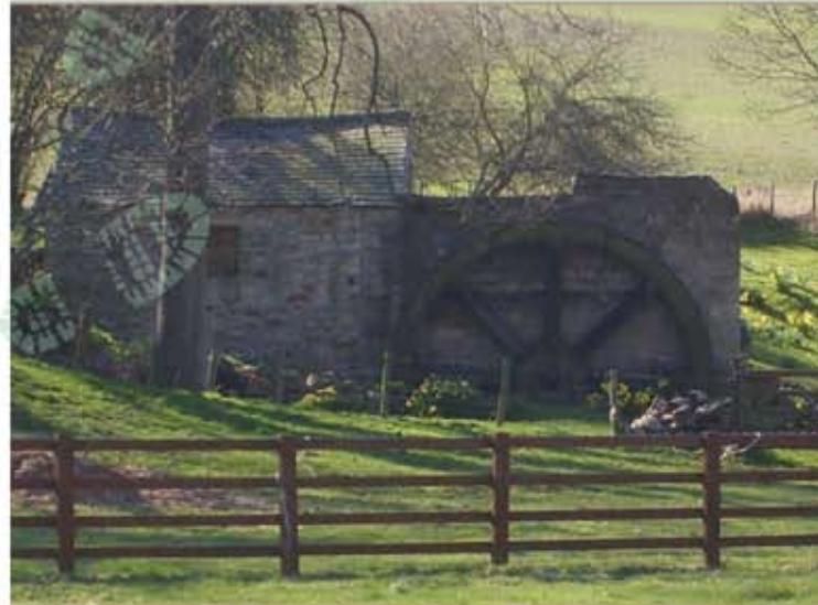
Photograph: Ridley Mill circa 2009